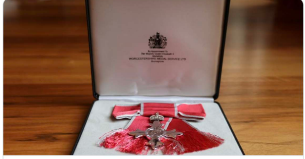
Exporters recognised in the 2020 New Year Honours list Exporting entrepreneurs and industry leaders are being recognised in the New Year Honours List. This comes as total UK exports stand at record high, rising...

He is the government's Director of Investment for the Middle East, Pakistan and Afghanistan based at the British Embassy in Dubai.