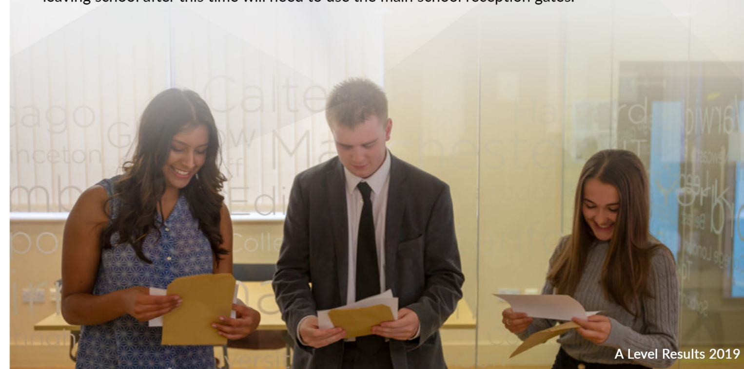
A Level Results 2019