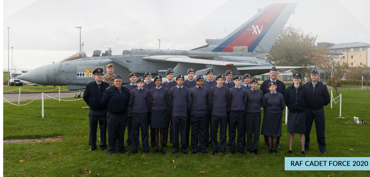
RAF CADET FORCE 2020

Pupils in Years 7 to 11 use Start Profile which is a digital platform that allows them to build a personal profile that guides them through their entire career journey. The Start Profile documents key moments of a pupil's broad range of experiences that Barr Beacon School provides. Pupils will use this tool to record documents in their own on-line 'personal locker' that can then later be printed and added into their Progress File which is presented at the end of Year 11. A pupil's Progress File is a record of their achievements. Additions can be made to a Progress File as pupils go on to further and higher education or training. The Progress File can be used to support interviews for 6th Form, college or employment.