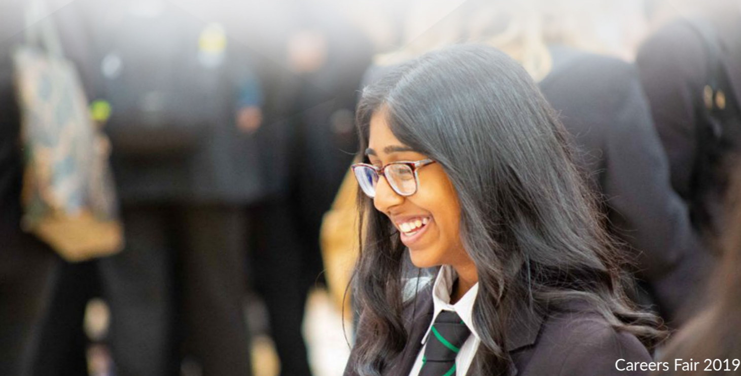
Careers Fair 2019

If you believe that your child is being bullied please contact their Head of House immediately.