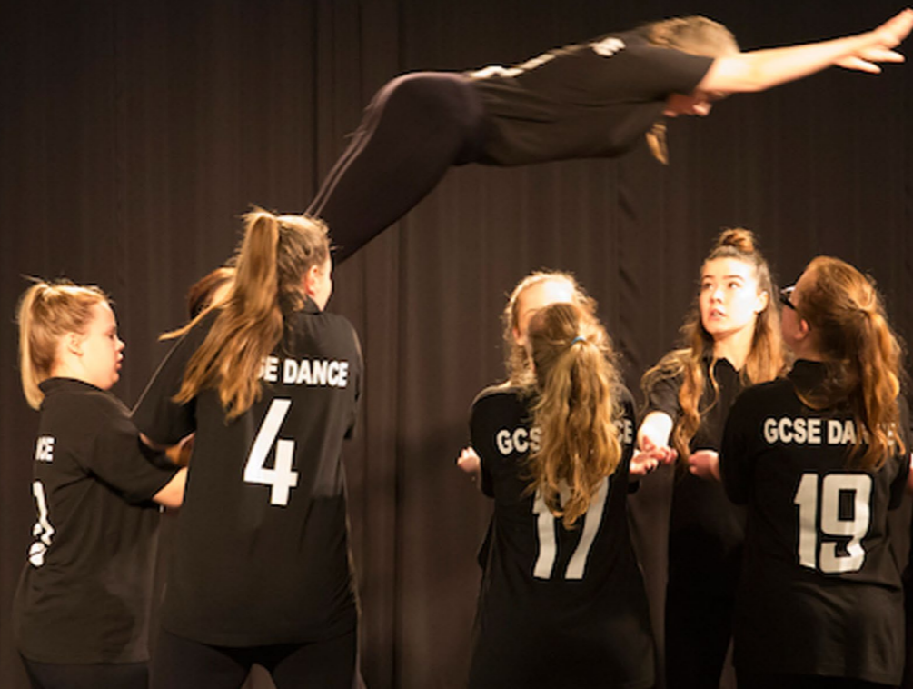
GCSE Dance Lesson