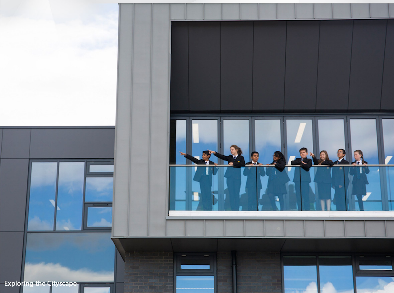
Exploring the Cityscape

Year 7 Settling-In Evening will be held on Wednesday 23rd September 2020 (provisional date & times to be confirmed)