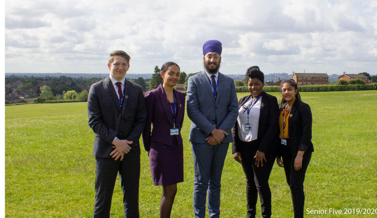
Senior Five 2019/2020

Pupils will normally attend assembly once a week as a House or a year group after registration in the morning. There is an extensive range of House competitions which encourage House identity and there is a system of commendations to reward good effort and attainment.