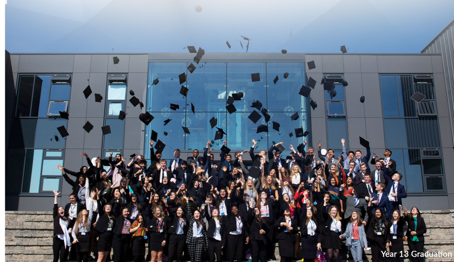
Year 13 Graduation

There is no other method of payment if you wish your child to purchase food or stationary in school. You can give consent for your child's fingerprint to be taken by signing on the relevant part of the Essential Information Form completed when your child starts at Barr Beacon School and no fingerprint will be taken without parental consent.