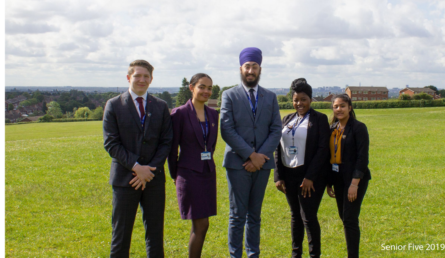
Senior Five 2019

Pupils attend assembly once a week as a house or a year group, after registration in the morning. There is an extensive range of House competitions which encourage House identity and there is a system of commendations to reward good effort and attainment.