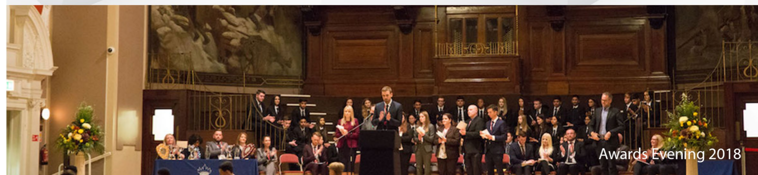
Awards Evening 2018

Pupils are expected to have a reading book in school each day. Wider reading for individual subjects and reading for enjoyment will enhance your child's access to the curriculum. We encourage you to promote reading at home and at school.