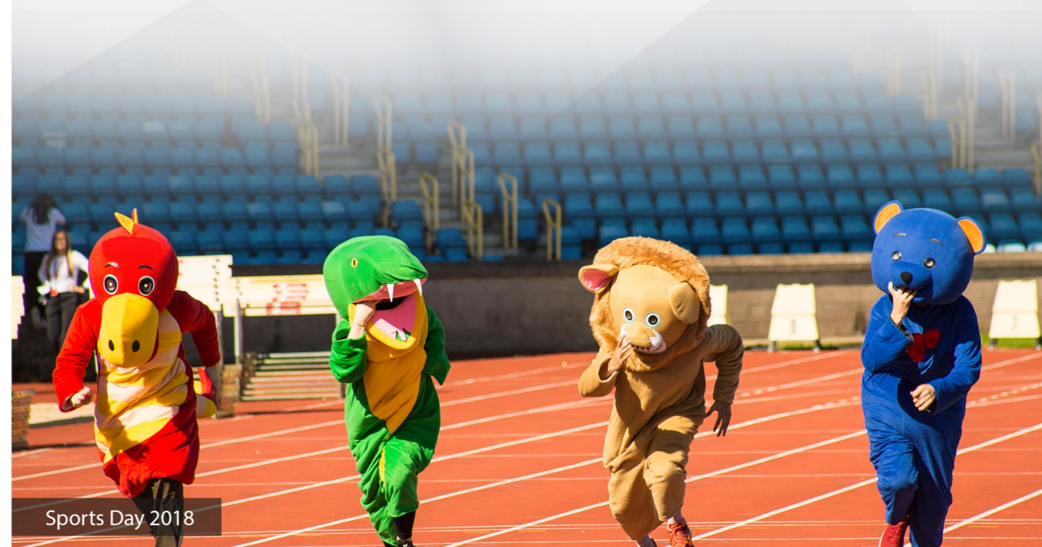
Sports Day 2018

*It is expected that all of these items of PE kit will have the pupils initial and surname stitched onto the garment. Uniform Plus, Clive Mark and uniforms.school know our requirements and will advise you accordingly.