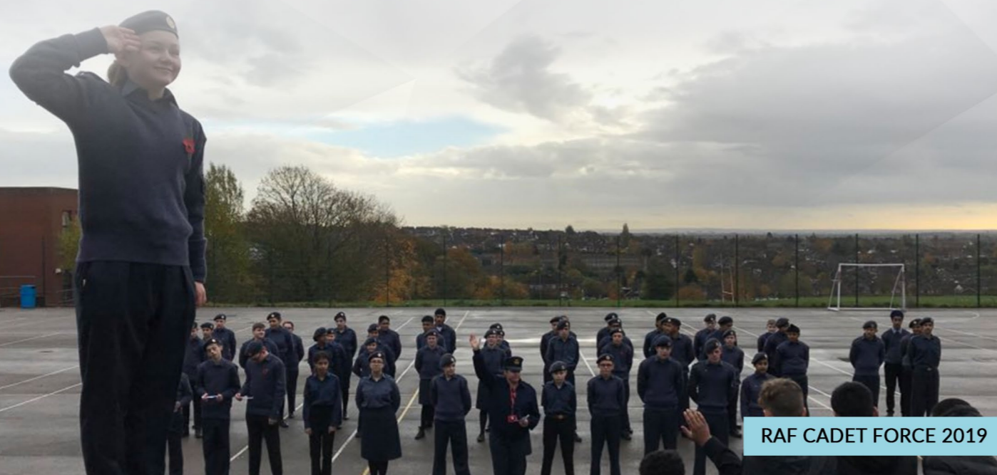
RAF CADET FORCE 2019

The final Progress File will be presented to pupils in Year 11. Additions can be made to the document if the pupil goes on to further/higher education or training, or as is applicable to the majority of Year 11 pupils, remains at school for their Sixth Form studies.